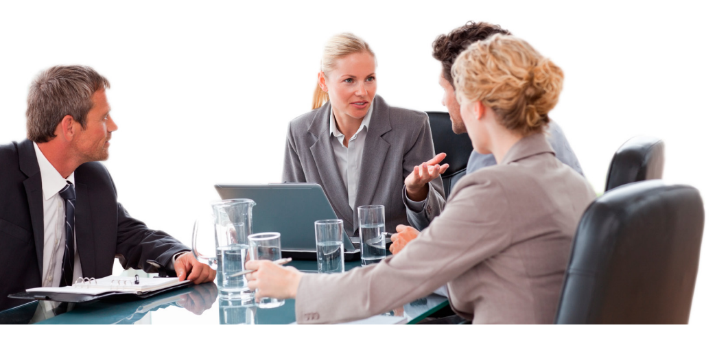
Visit kmbs.konicaminolta.us/dispatcherphoenix for more information on other Dispatcher Phoenix offerings.

© 2015 KONICA MINOLTA BUSINESS SOLUTIONS (CANADA) LTD. All rights reserved. Reproduction in whole or in part without written permission is prohibited. KONICA MINOLTA, the KONICA MINOLTA logo, Count on Konica Minolta, bizhub, and Giving Shape to Ideas are registered trademarks or trademarks of KONICA MINOLTA, INC. Trademarks of the Canadian Breast Cancer Foundation, used under licence. All other product and brand names are trademarks or registered trademarks of their respective companies or organizations.