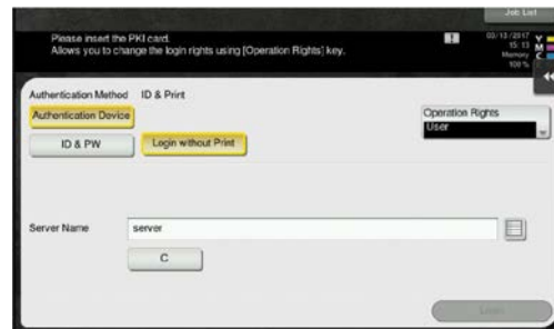
Network Access: The AU-211P provides network access with user authentication via Windows Active Directory. And with HID Global ActivID® ActivClient® software embedded in the device, Konica Minolta can guarantee support for all historical versions of CAC/PIV smart cards — including future profiles under development.

The public key infrastructure (PKI) print feature allows users to securely send print jobs from their PC directly to the Konica Minolta MFP including their PKI credentials. The print job will remain on the MFP HDD until the specified user is directly at the MFP to retrieve their document. Once authenticated using their CAC or PIV card, their print job will be output. No more worrying about secure documents sitting on the MFP output tray for anyone to see or fall into the wrong hands.