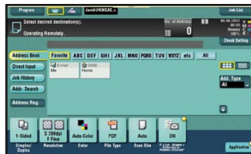
Scan-to-Me, Scan-to-Home: Document distribution can be restricted to logged-in users' e-mail addresses (Scan-to-Me) or users' shared folder (Scan-to-Home) as defined in Active Directory. Each scanned document is protected with AES 256-bit encryption and the system can use the CAC/PIV card to create digitally signed and certified e-mail directly at each bizhub MFP — no need to use PCs to add digital signatures.