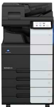
bizhub i-Series 451i