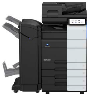
bizhub i-Series 551i