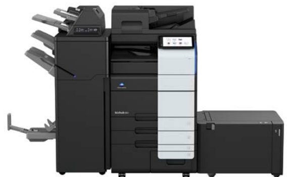
bizhub i-Series 651i